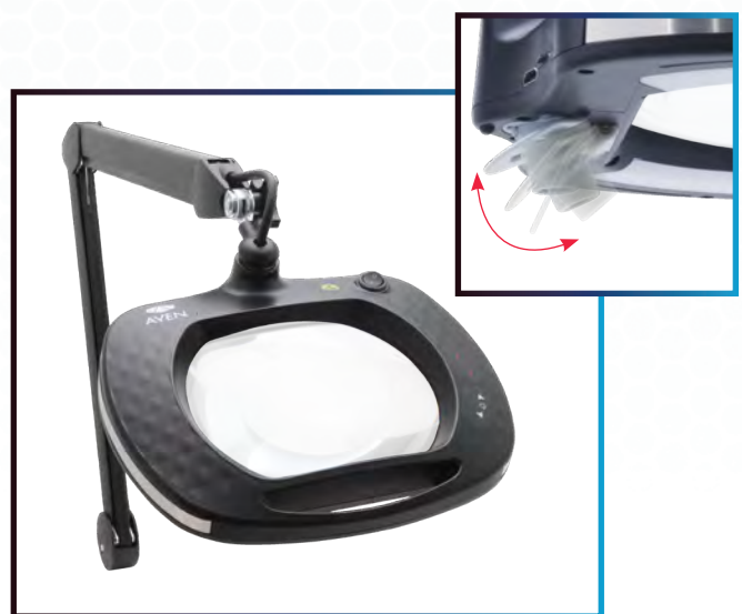
item # 26512-CAM