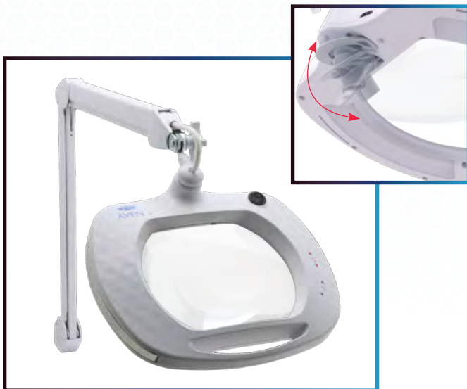
item # 26510-CAM

26512-CAM - Mighty Vue Inspector 5 Diopter Magnifying Lamp w/ Built-in Camera | ESD Safe (Black)